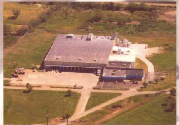
Swarco Bead Facility

Metal Finishing Equipment and Supplies 5811 Elwin Buchanan Drive Sanford, North Carolina 27330 (919) 775-7149 • Fax (919) 774-3130